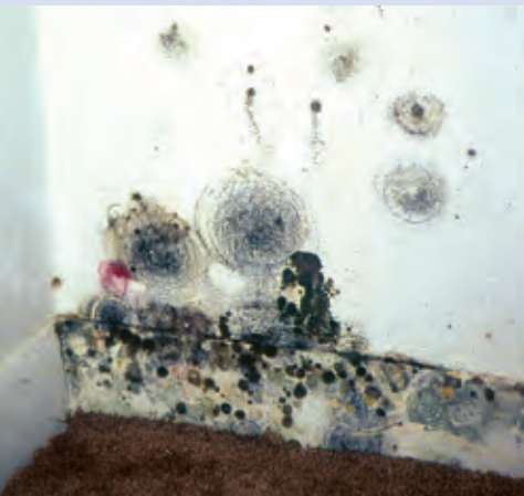
Photo 3A: Mold growing in closet as a result of condensation from room air