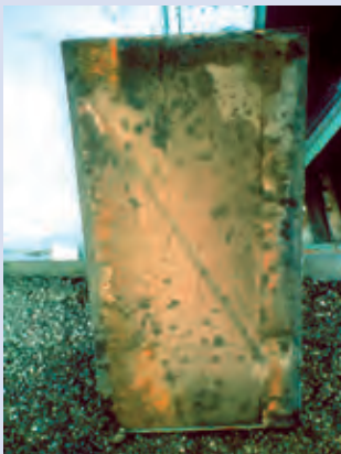
Photo 4A: Contaminated fibrous insulation inside air handler cover

Do not run the HVAC system if you know or suspect that it is contaminated with mold. If you suspect that it may be contaminated (it is part of an identified moisture problem, for instance, or there is mold growth near the intake to the system), consult EPA's guide Should You Have the Air Ducts in Your Home Cleaned? 4 before taking further action (see Resources List).