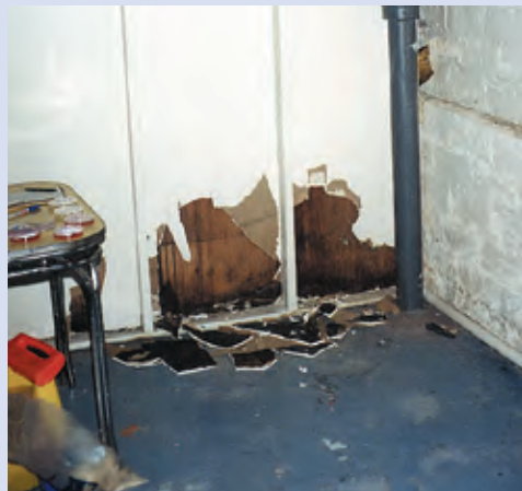
Photo 3B: Front side of wallboard looks fine, but the back side is covered with mold