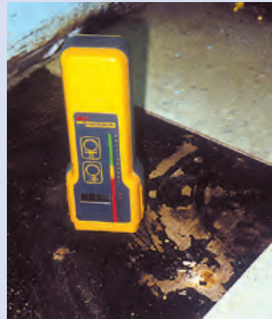
Photo 9: Moisture meter measuring moisture content of plywood subfloor